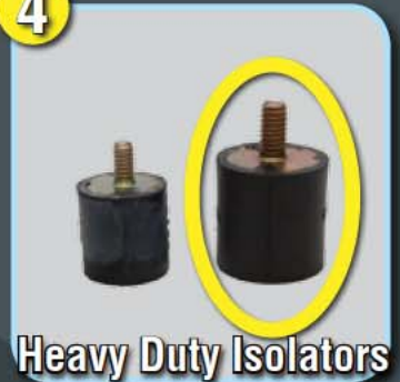
Heavy Duty Isolators