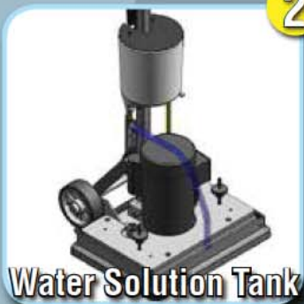
Water Solution Tank